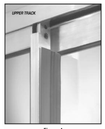
Figure 4 VINYL DRAFT SEAL