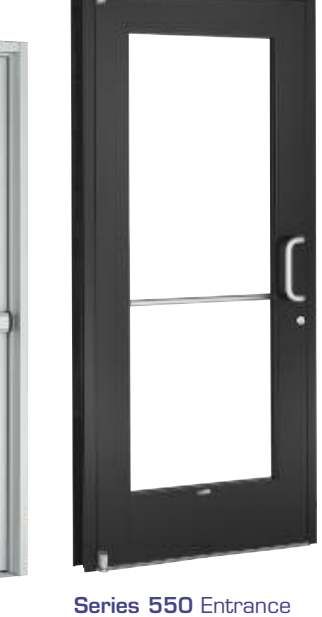
with Clear Hardware and 10" (254 mm) A.D.A. Bottom Rail

Series 400 Entrance with Standard Exit Device