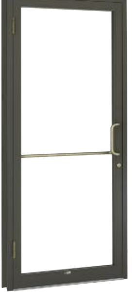
Series 250 Entrance with Champagne Finish Hardware

As an industry leader in the manufacture of entrance doors and frames, United States Aluminum products are consistently built to the highest industry standards, ensuring years of reliable service. Mechanically fastened shear blocks and welded corner construction creates a rugged structural corner assembly backed by a lifetime warranty. These entrances can easily accommodate a wide variety of custom hardware for specific job requirements.