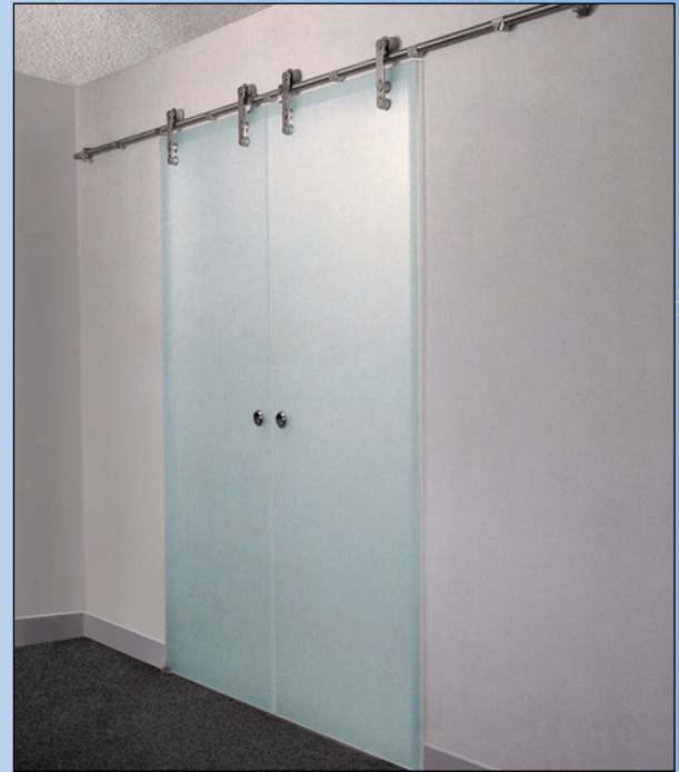
Typical Wall Mount Installation With Double Sliding Doors