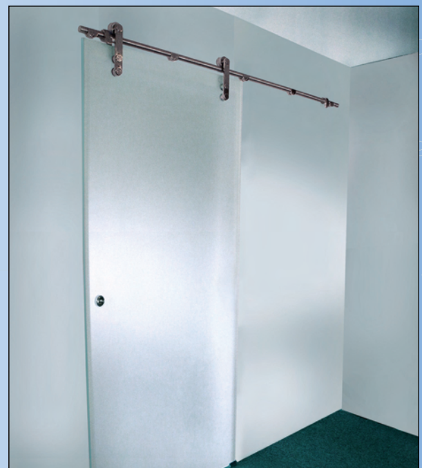
Typical Glass Mount Installation With Single Sliding Door

The Newport Series Sliding Glass Door System brings a contemporary new look to the home or the office. It can be installed on glass partitions or directly to the side of a sufficiently reinforced wall. The adjustable Top Rollers make final adjustments quick and easy, without the need to remove the door. Their smooth operation and solid stainless steel construction minimizes maintenance issues.